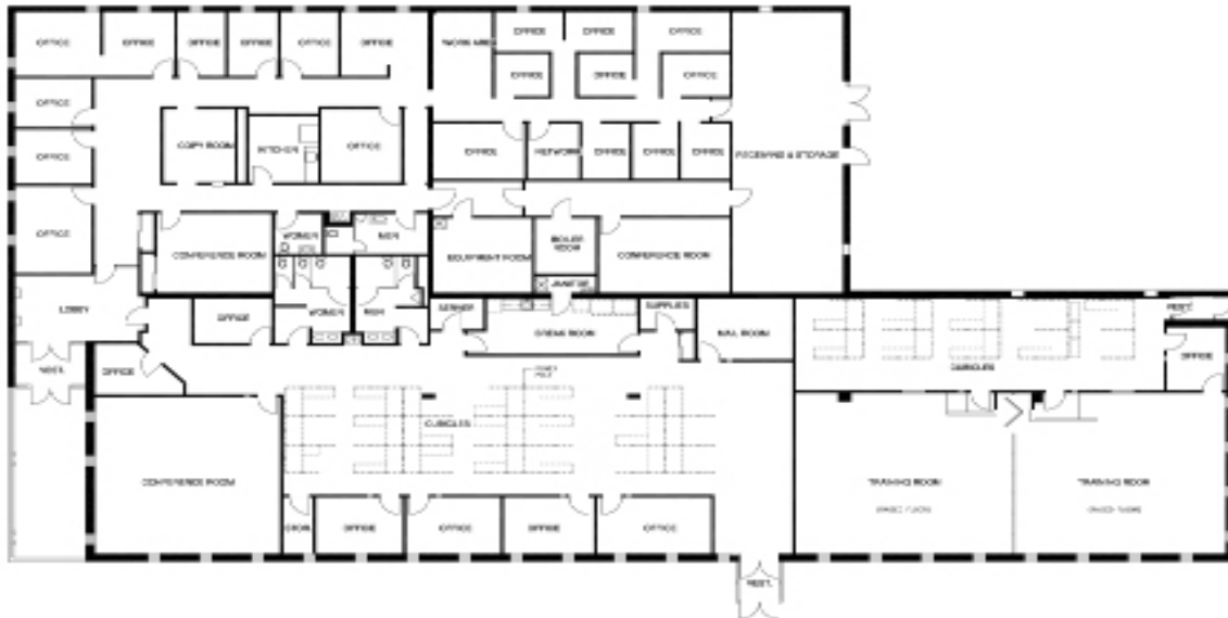
FLOOR PLAN SCALE: 1/8" = 1'-0"