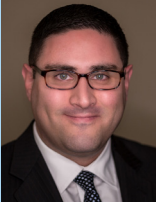
Lic. # 300A1165937